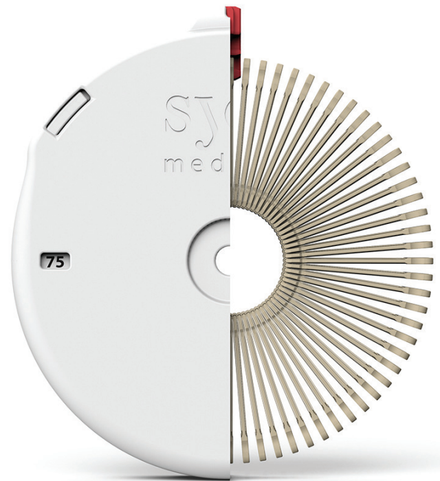
One of the cartridge designs used in the inhaler for dispensing the medication.

"With just two weeks ahead of us, we turned our Stratasys Objet 350™ 3D Printer into our R&D hub. I designed the inhaler prototype and we 3D printed the parts," recalled Itay. "We wanted to show how