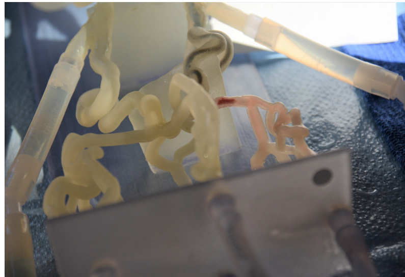
This 3D printed vascular model is being used to train on the removal of a clot.