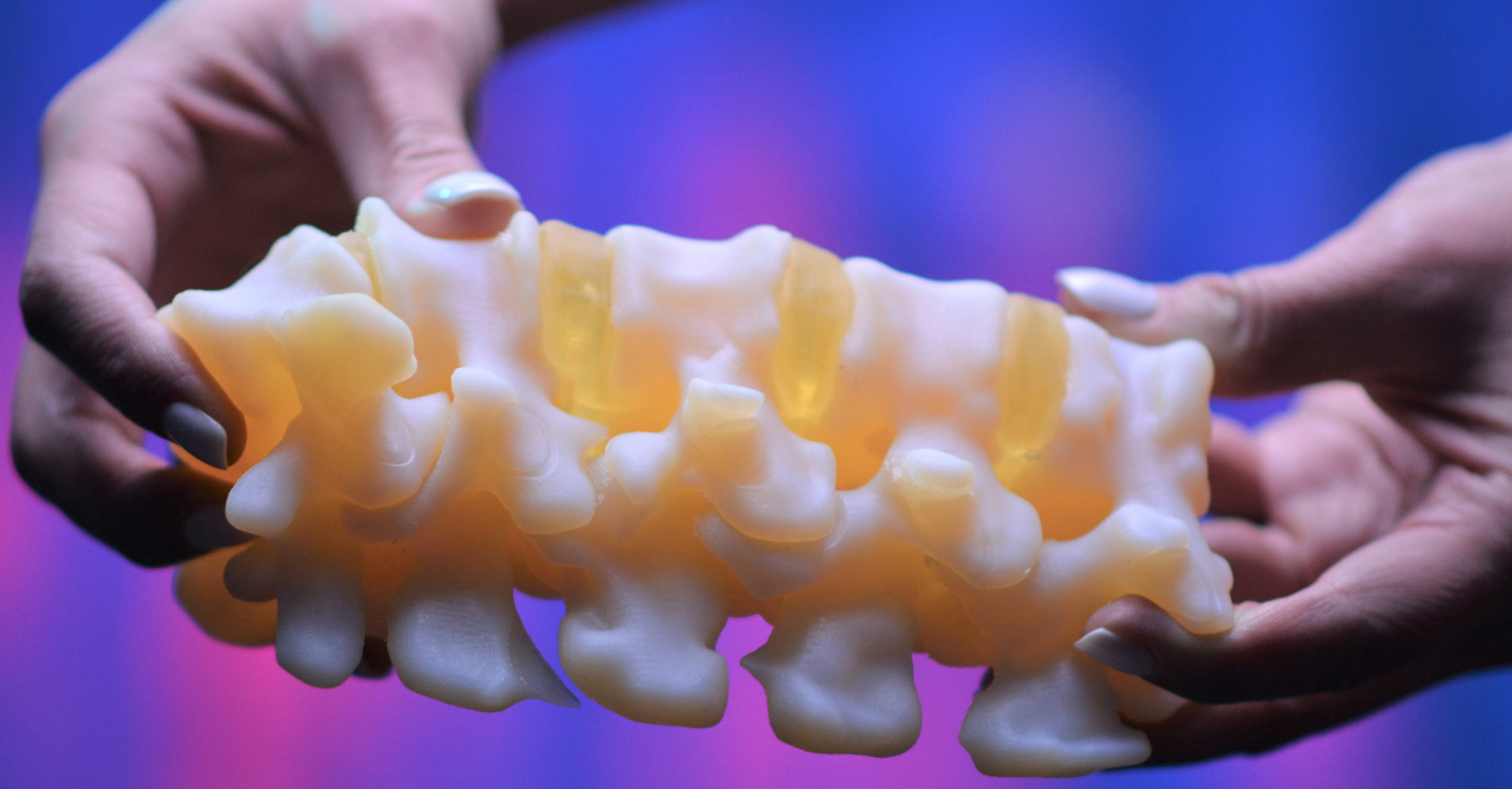
This human spine model incorporates both rigid and flexible materials.

But despite this capability, the JI had reached the limits of current 3D printing materials. To stay true to its mission of innovation, new technology was needed. That meant new materials with a realistic feel and response, more representative of real human tissues. Human cadavers and animal models provide a close approximation, but they can't replicate specific human pathologies. They can also be costly to acquire and maintain.