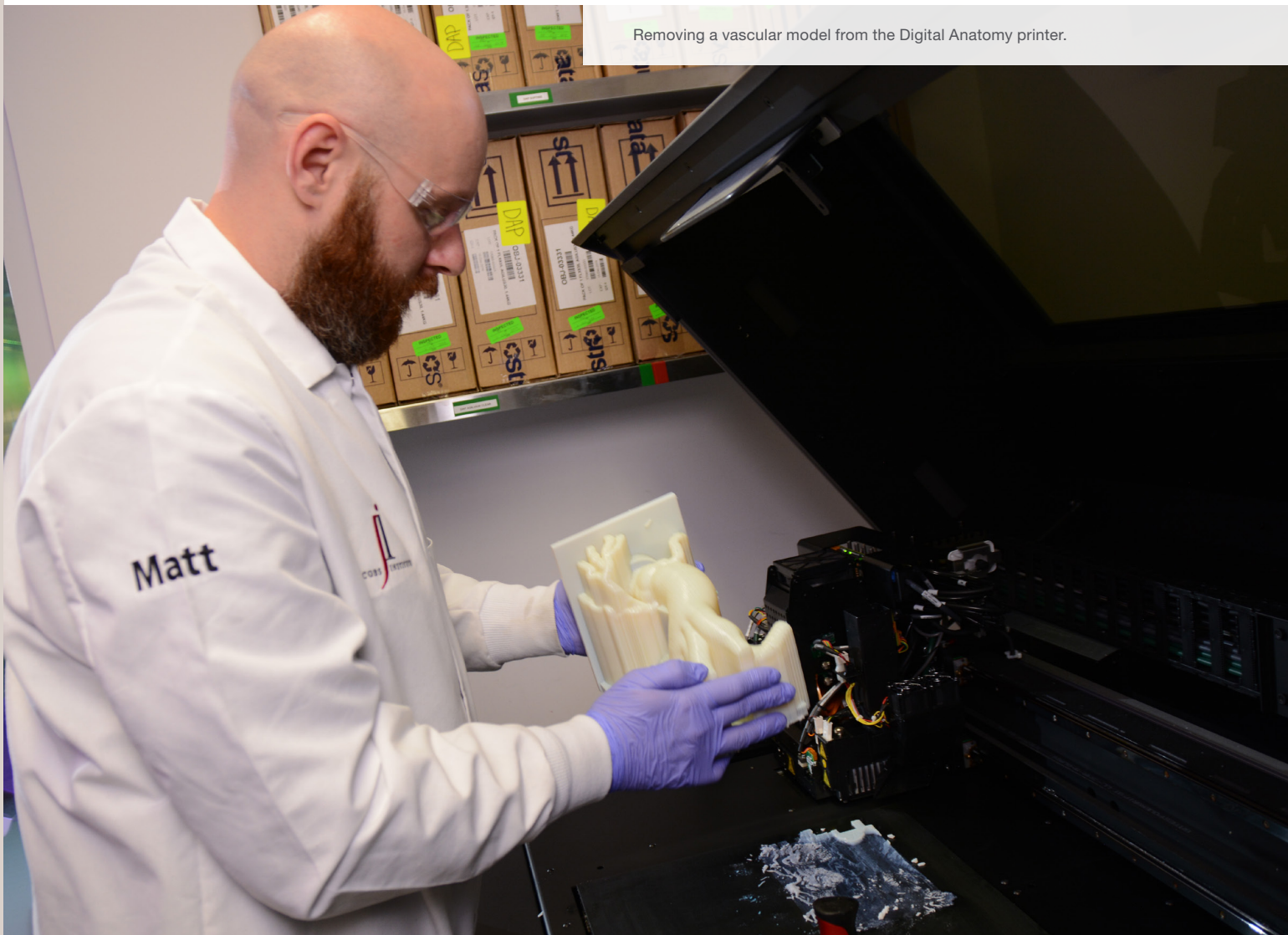
Removing a vascular model from the Digital Anatomy printer.

Realistic materials are only half of the story, however. Combined with GrabCAD Print™ Digital Anatomy™ software, the result is a powerful synergy that makes the Digital Anatomy printer the next generation in 3D printed medical modeling. Specifically designed for medical applications, the key benefit of GrabCAD Print software is the ability to select specific human anatomical tissue with