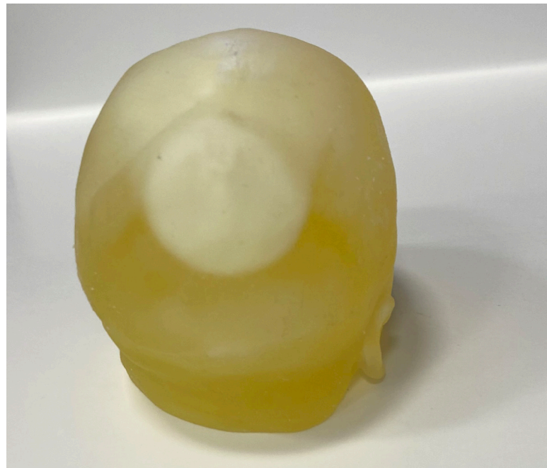
Craniosynostosis Prototype Model created using Bone Matrix and Tissue Matrix Material - Rear/Overhead View.