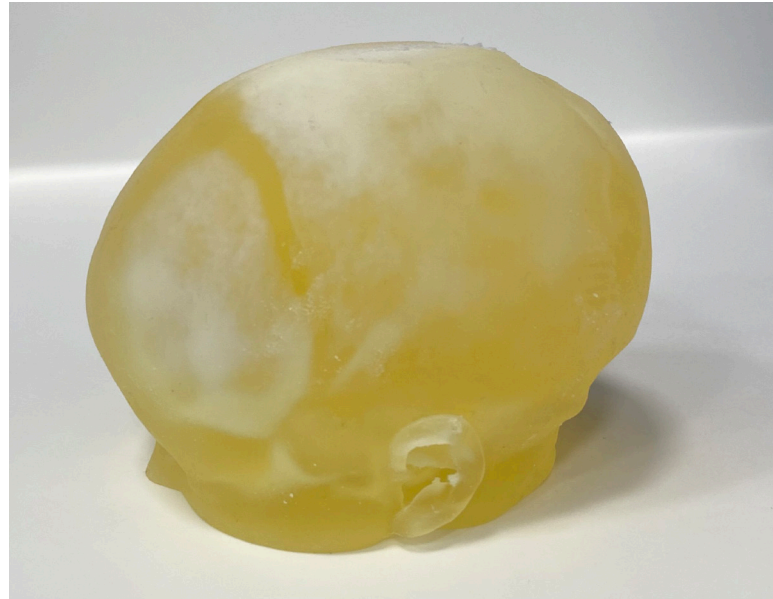
Craniosynostosis Prototype Model created using Bone Matrix and Tissue Matrix Material - Side View.

To achieve that goal the hospital acquired a Stratasys J750™ Digital Anatomy™ 3D printer to augment its simulation center. The printer, combined with the Digital Anatomy software, is able to create incredibly realistic anatomical models. To achieve this level of realism, the Digital Anatomy printer makes use of several special materials designed to mimic human bone and tissue: BoneMatrix™, GelMatrix™ and TissueMatrix™. The software leverages these materials to enable over 100 sophisticated anatomical presets to produce models that demonstrate clinically validated realism in both feel and biomechanical performance.